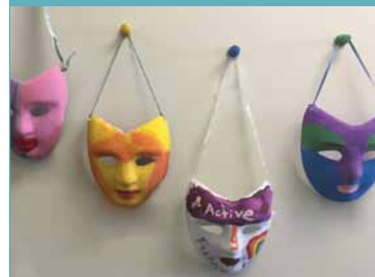
A skilled therapist utilizes the mask-making exercise to help process traumatic events and painful feelings. This photo depicts some of decorated masks on the wall in the COOL section of the Center's building.

“On the inside I hide my fear that things will not get better.”