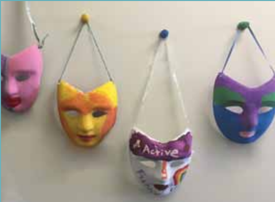
A skilled therapist utilizes the mask-making exercise to help process traumatic events and painful feelings. This photo depicts some of decorated masks on the wall in the COOL section of the Center's building.

“On the inside I hide my fear that things will not get better.”